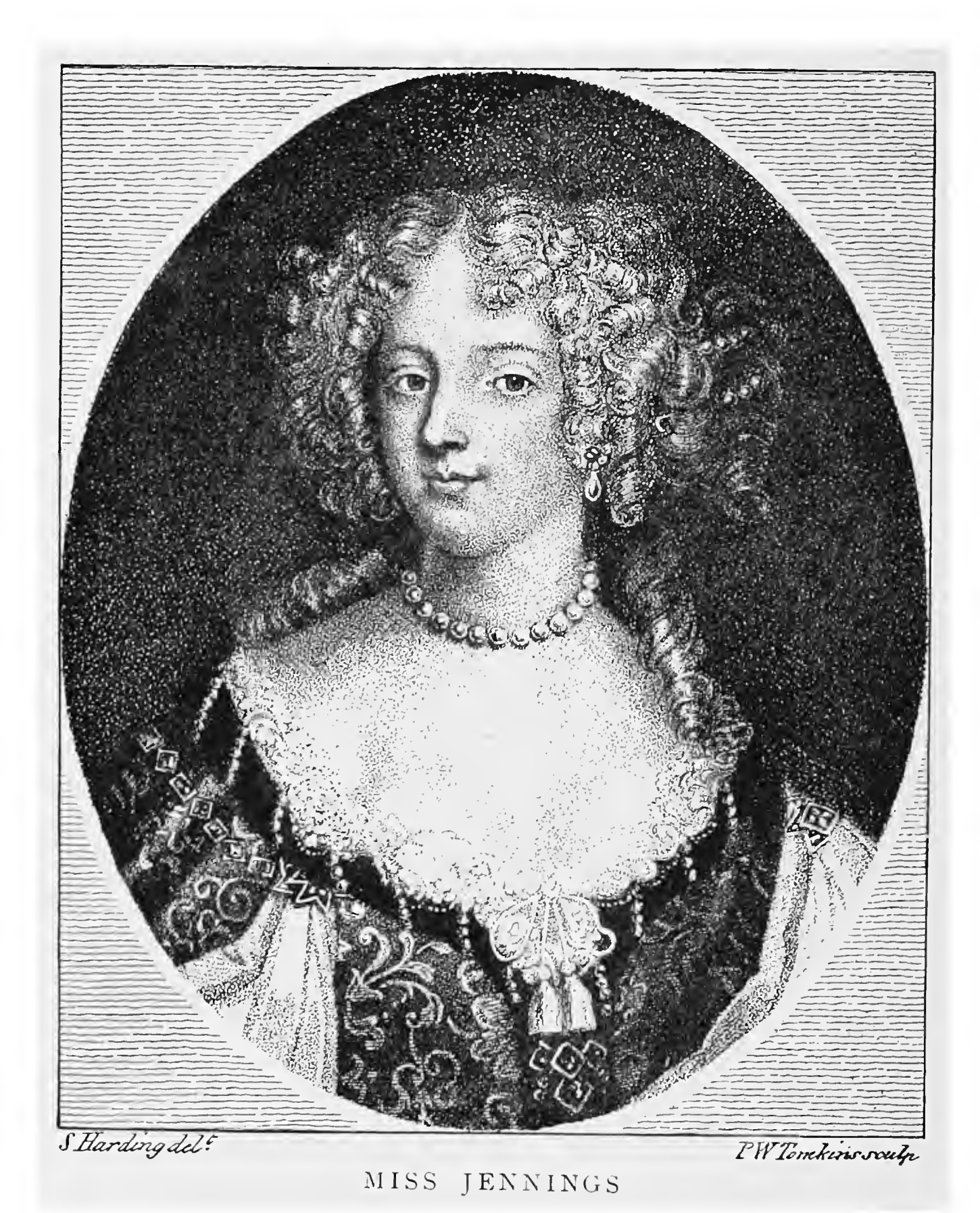
From the picture by Verelst formerly at Ditton Park